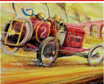
NOSTALGIE DU CIRCUIT DE DIEPPE

Dieppe circuit's nostalgia , vintage cars exhibition & parade will take place on 2 nd and 3 rd September in Dieppe (Seine-Maritime). The cars will follow the historic 1907's race route and will stay for a static display in le château d'EU. More info on: http://diepperetro.pagesperso-orange.fr/ Rétro-Nautic is an event dedicated to vintage dinghies and keelboats on 23 rd & 24 th September in Ouistreham (Calvados). Info on www.normandie.fr/retro-nautic .